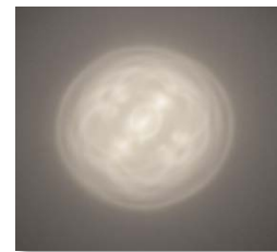
Spot From Collimated Light (no diffuser)