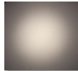
Collimated Light with M-Series Mixing Diffuser